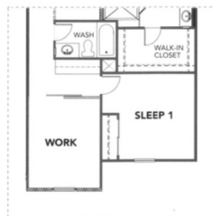
WORK OPTION AT SLEEP 2